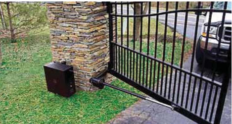
A safe choice, reliable in any condition. Sturdy, for swing gates up to 600 lbs and 16 ft.